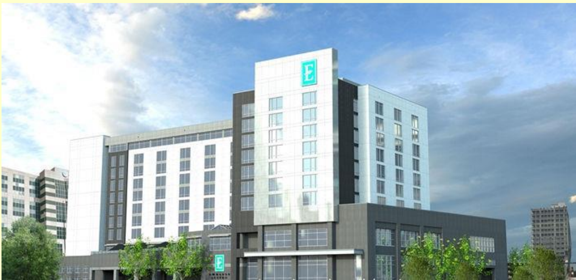
Embassy Suites Uptown, Charlotte - Venue of the UBAANA 13 th Annual Reunion