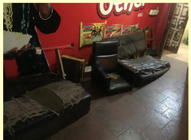
Dilapidated Bus Stop & Common Room in UNIBEN