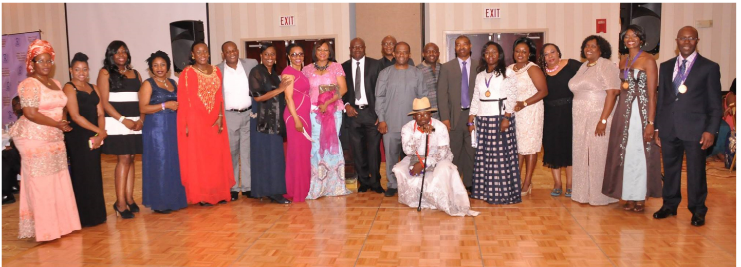
The 2016 Reunion New York/New Jersey Local Organizing Committee