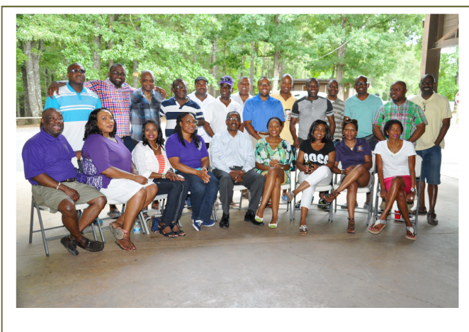
Members of the UBAANA Carolinas chapter enjoy a day of fun, family and friends!