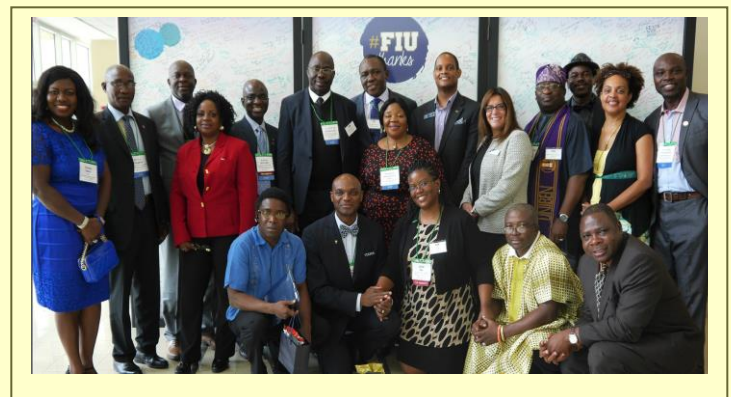
UNIBEN and UBAANA Officials visit Florida International University