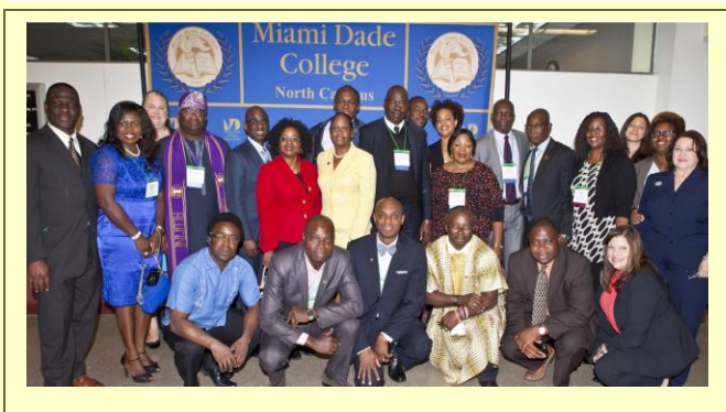
UNIBEN and UBAANA Officials visit Miami Dade College