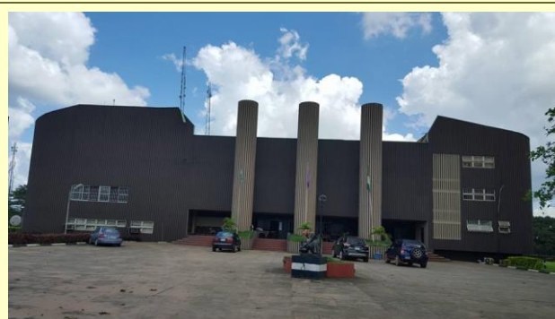
Akin Deko Auditorium, University of Benin

The EXCO meets on the first Sunday of the month at 4 p.m. Eastern. All are welcome to attend. Contact the Sec-Gen for call-in information.