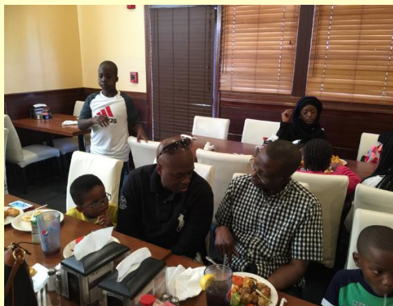
May 2016 Meet & Greet Affair