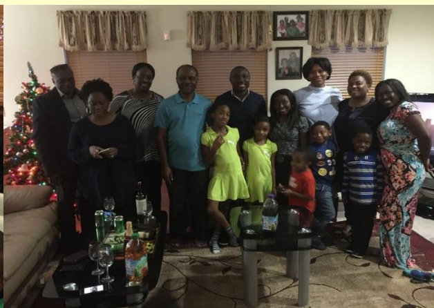
December 2015 Xmas Affair